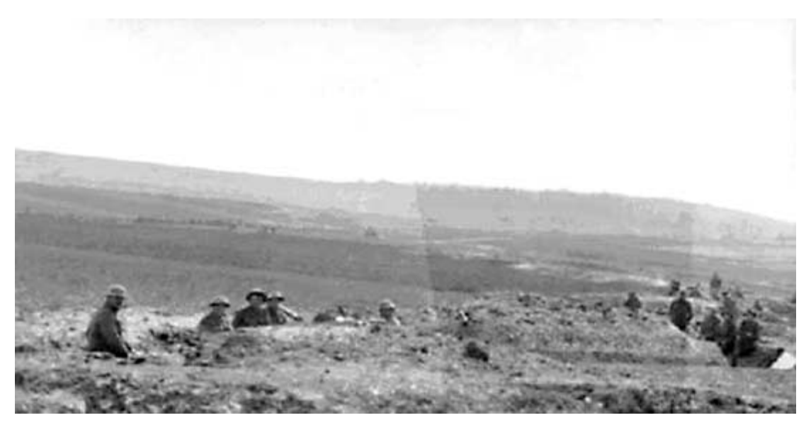
Reserve line at Pozieres

are all Sydney chaps so passed quite a merry night during which Fritz was quite annoying with his barrages.