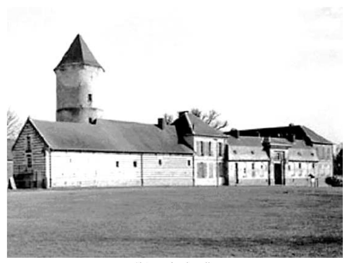
Château de Flesselles

Slept like a log all night. Up with the larks this morning feeling awfully fit and well. Great climate here. Down in stables all the morning. Horses stood the journey rather well. Out for a 10 mile route march this afternoon. Went through several villages among which was Flesselles. Every little village, no matter how small can boast of a church. In the evening Chas and I visited the chateaux and had a saunter through the House Park. Gee it's a paradise. There's one long drive through one portion of the Park which is the most magnificent I've yet seen and I spent 8 days in Marseilles. Mail arrived tonight. Managed to catch one from H.R. "Hossie" and "Bream". Awaiting orders to move up to the line. Wish they would hurry up and come to hand. Can't settle down to a quiet existence. Utterly impossible.