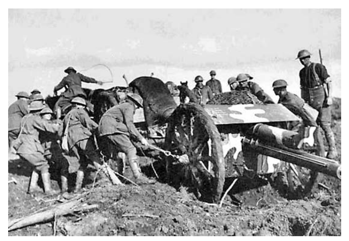
Australian 18lb battery gun stuck in Flanders Mud

that I go down to the waggon line for a few days spell, and as its an order I go down tomorrow morning. Nothing much doing.