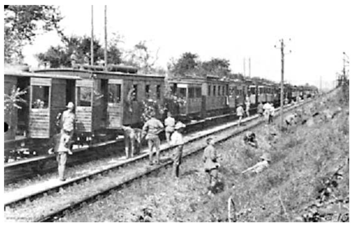
As a troop train carrying Australian soldiers from Marseilles to Le Havre makes a rest stop, the soldiers have disembarked to stretch their legs on the tracks beside the train, rest on the embankment (right) or pick wildflowers to decorate the train carriages.

Chas being in charge of the commissariat Department procured drinkables and cooked pheasant. Passed Paris about 3.30 but did not see much of the city. Went round through the outskirts. This country is the most beautiful I've yet seen. On the whole it seems to be one big beautiful garden. Everywhere the troops either travelling or massing on the railway stations, or doing sentry go on roads, bridges or railways. Every station we've been through we've been cheered and farewells waved from everywhere. The French people seem to be very much attracted to our boys and they likewise to them. Expect to reach our destination (Le Havre) early tomorrow morning. Bitterly cold tonight. Early to bunk.