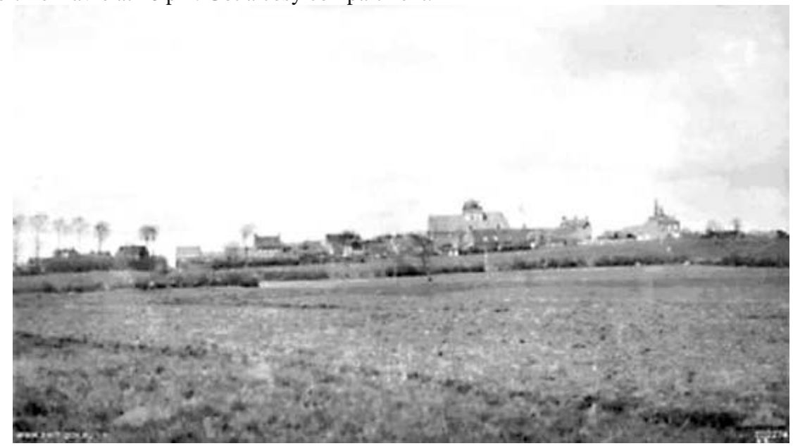
A view of the village of Borre, in Northern France, showing the church in the centre, and the house to the right which was used as 1st Brigade Headquarters.