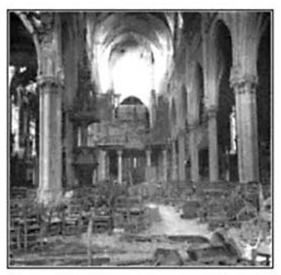
Street and church interior of Estaires