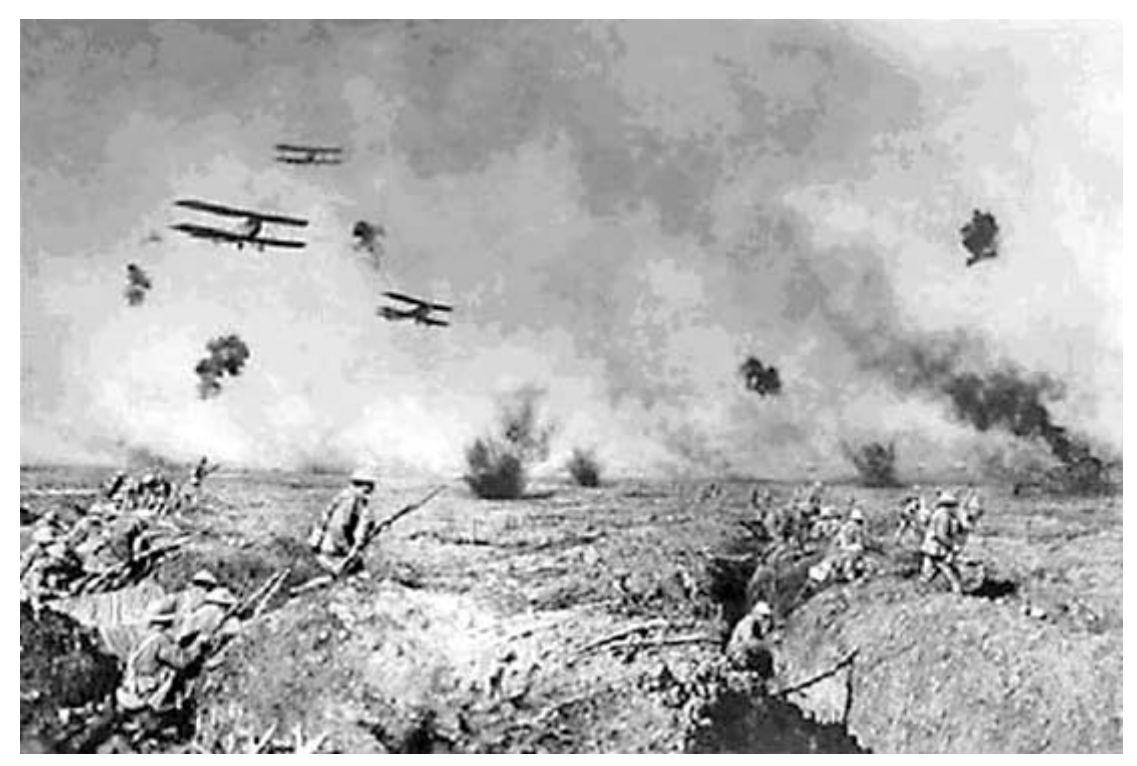
Fleurbaix battle front