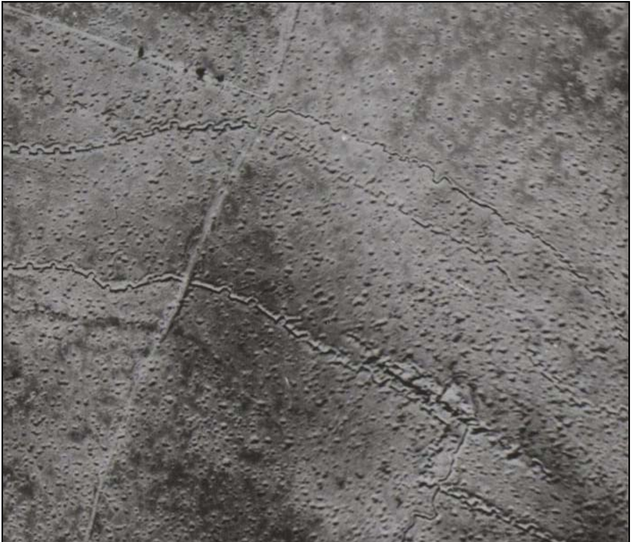
Map of Ligny-Thillooy showing the trench system

Gee, what a Devil of a night. Sat up in a dug out with water 6 inches deep. Got an awful cold. Cleared up a bit today thank Heaven but all this trench has fallen in. Quite a war on today.