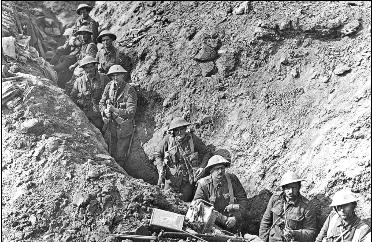
Infantry from the 2nd Battalion, Auckland Regiment, New Zealand Division near Flers.