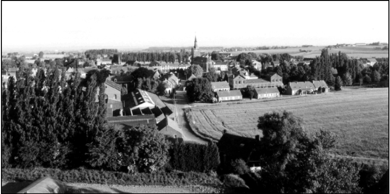
The town of Godewaersvelde

Ypres. Saw what's left of the Cloth Hall and Cathedral. Both looking very pretty after their sundry bombardments. Ypres is blown to blazes generally. Must have been quite a decent city once upon a time. Our guide lost himself completely so had to engineer my way out by map. Got within half a mile of the Battery when we got a gas alarm signalled, but it missed us. Damn these Stun machine guns.