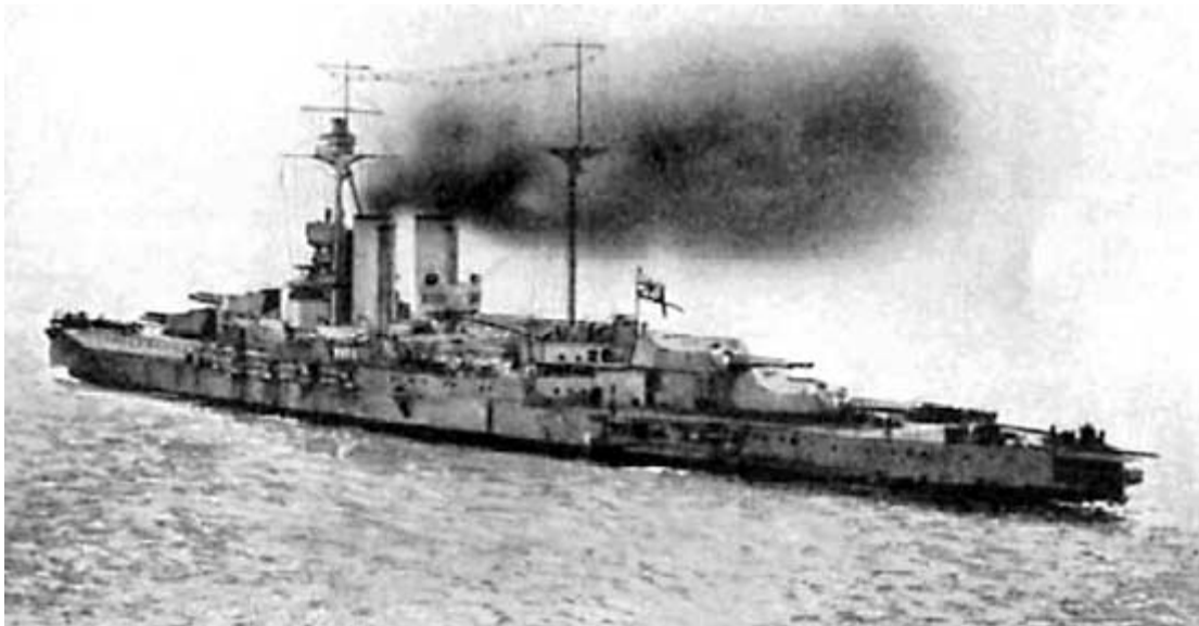
H.M.S. Queen Elizabeth used to support Anzac troops at Gallipoli