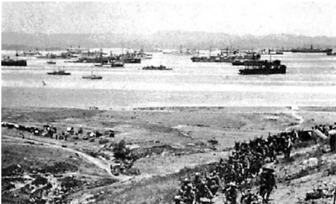
Activity in Mudros Bay, Lemnos, with troopships in the background and French troops in the foreground.

Weather still fine. Went for another pull around several troopships today although was disappointed at not getting ashore. Was alongside our biggest transport, the Minnewaski only 15,000 tons. No word about our leaving as yet. A circular issued by General Birdwood says that our coming fight will be one of the hardest and greatest in the war. Hope so. Lizzie leaves here at 12 pm loaded with 15 inch shrapnel and our friends will be wondering what on earth's up by this time tomorrow. Still waiting for mail.