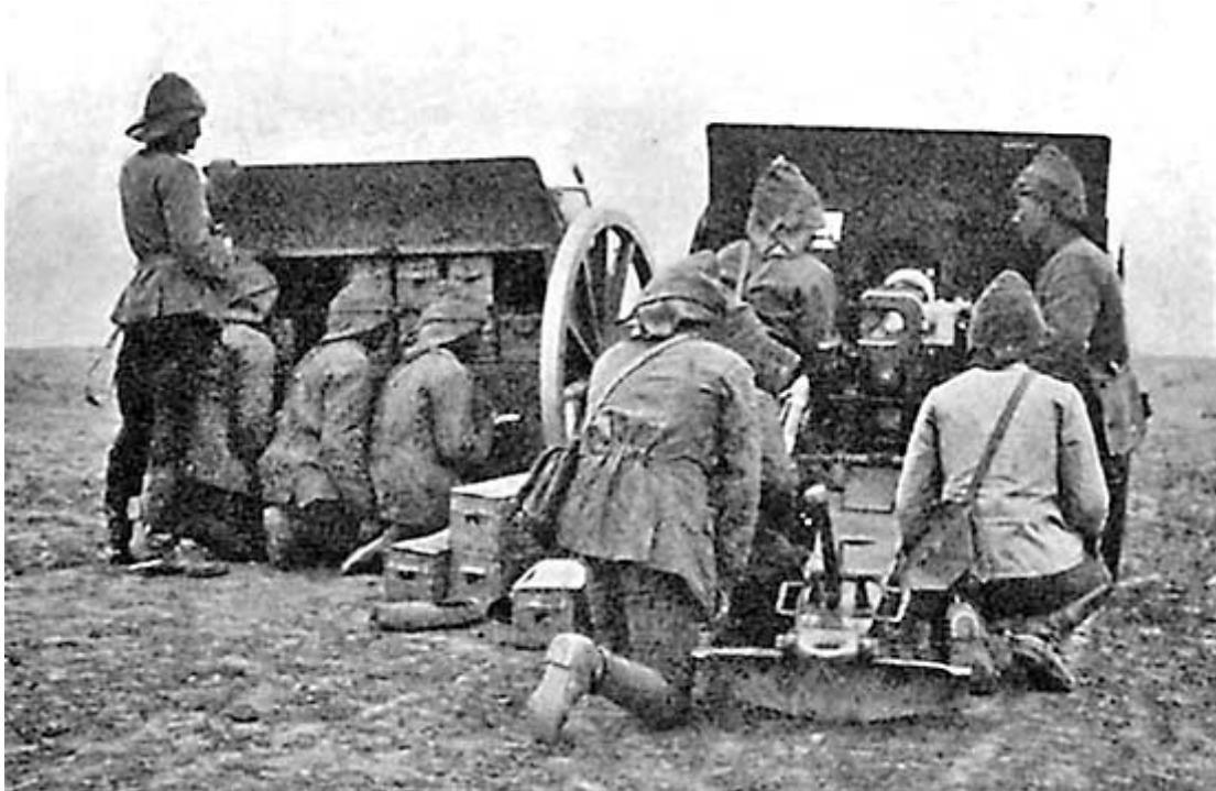
Turkish Battery in action at Gallipoli (GW)

travelling 15ft underground coming out again and going for a further 25yds, stopping exactly 7ft in front of the gun, without exploding. Had it done so, 'B' sub would have been hanging on the moon by now. The only one to miss exploding out of 10. Later all day long we have been paid special attention by this gun and its associates. A 4.7 and 7.5 "H". No damage done however, only knocked the landscape about a bit.