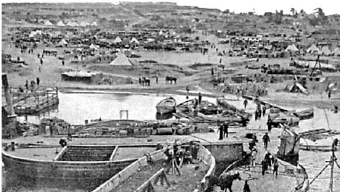
Landing at Cape Helles

Good old round scrap last night. Didn't we give them something. The aerial torpedoes played particular 'H'. Got into one bit of a dust up. Great. Had a screw at a probable position for a 15 pounder. Had to crawl out of our 2nd line trench, and must have been spotted by one of their snipers, made things that warm that we had to get back again. Completed our map this afternoon. Got relieved by Mr Olding. Awfully sorry to get down here again (I don't think). Had tea down at the Bty. Quite a change to have a meal without 14 dead Turks within 5yds of you.