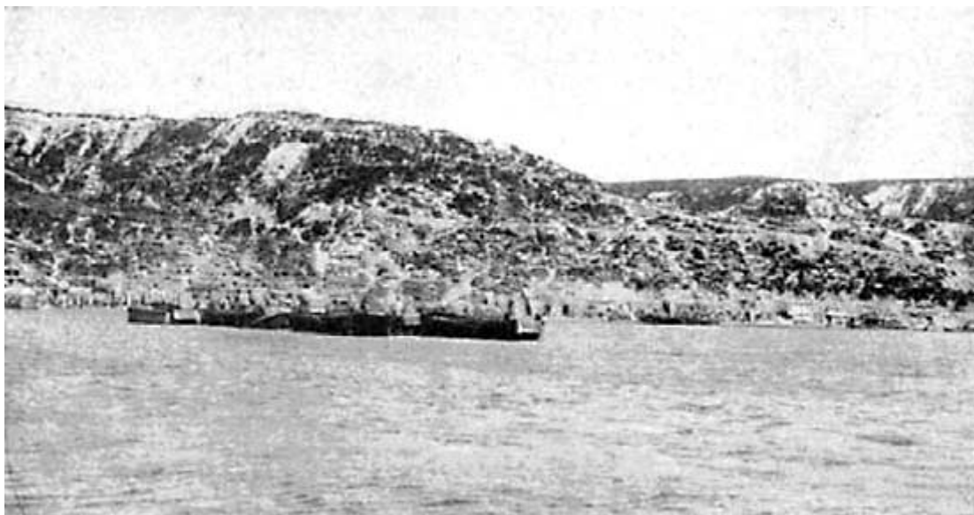
A view of the Gaba Tepe Landing