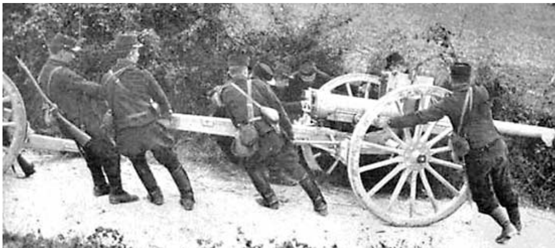
French battery moving a 75mm gun (CPE)

Heavy shelling all day, both the Turks and our artillery going strong. They've got a new Howitzer Bty somewhere about and they know how to use it. Have just got the order to draw 1000 rounds of fused shell for another big bombardment which takes place, I believe, on Monday. Bgr Filstead and Daily returned from hospital. Both O.K. again. A battleship came up early this morning and smashed things about in the vicinity of Kum Kale. Scrapping on and off all night.