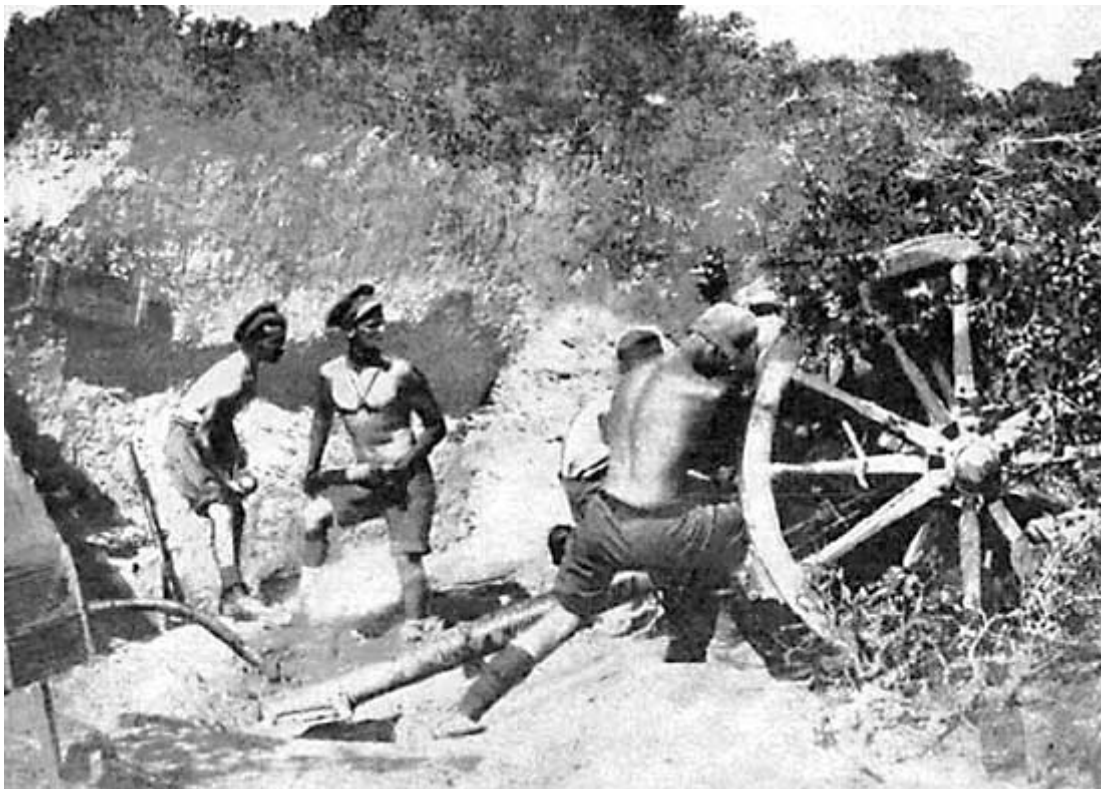
Anzac troops working the guns at Gallipoli