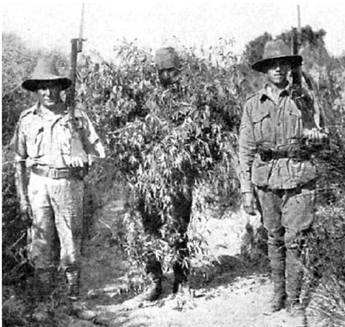
A Turkish sniper, disguised as a bush, captured by Anzacs

want for me to get out in the open and then amuse themselves by raining every available gun on me. Got into a dust up this afternoon. Believe there is going to be an attack along our whole front by our friends. We're ready for them. Any quantity of ammunition ready now. Saw Majestic today in an awful mess.