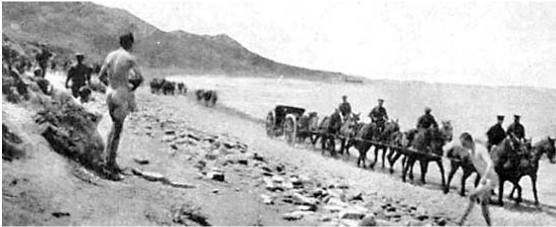
Battery of artillery on the Gallipoli shore (GWS)