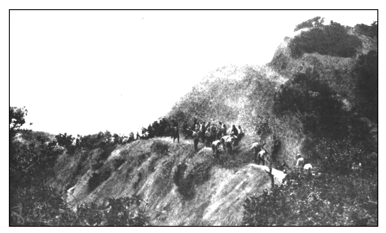
Walkers Ridge leading down to 'W' Beach